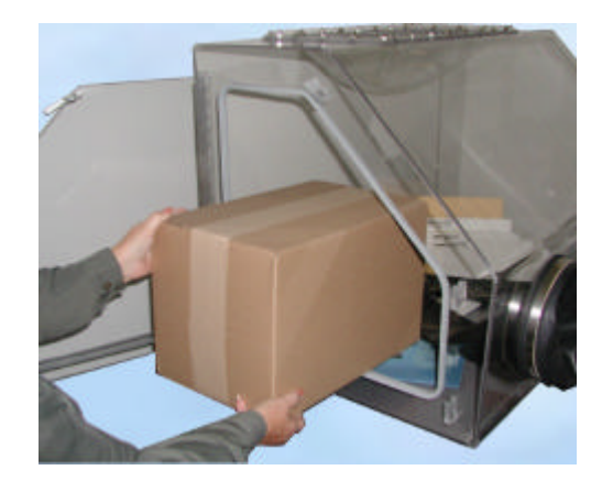
The 18" x 18" Side Door allows larger packages to fit inside the glove box.

As the user enters the gloves their hands are changing the volume inside the glove box. The Diaphragm Top expands and contracts with the changing volume, maintaining a comfortable and uniform internal pressure.